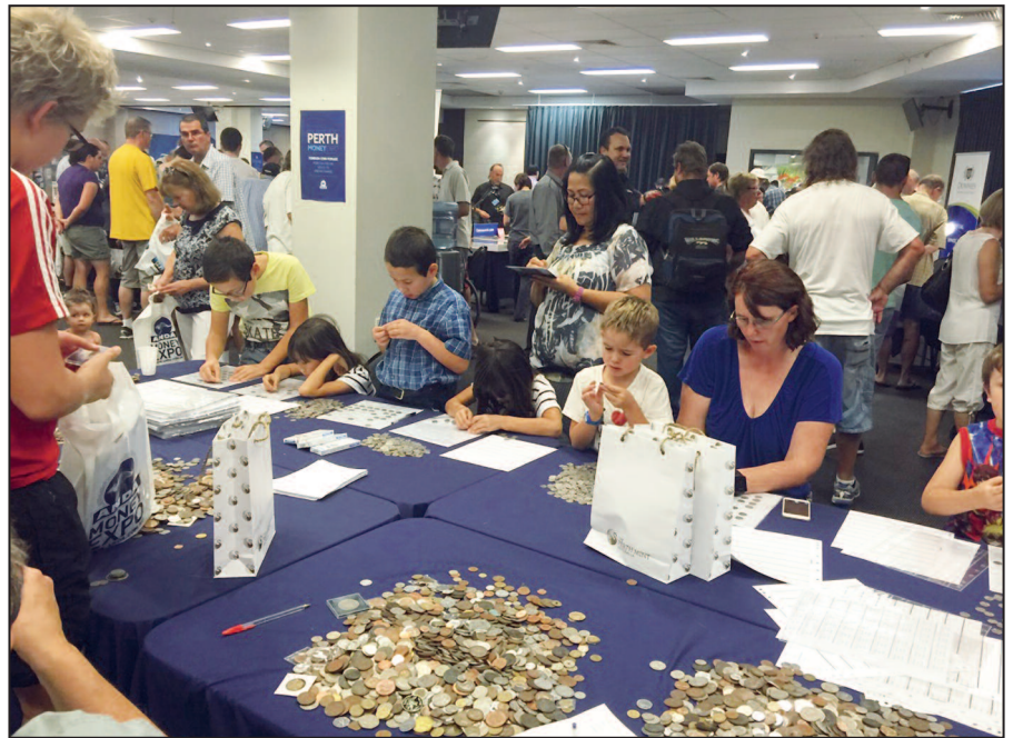
The Five Cent Forage in progress at the 2016 ANDA Perth Money Expo.