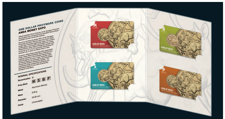
Open and closed views of ANDA's forthcoming folder to house the four Privy Marked coins (P, B, M AND S).